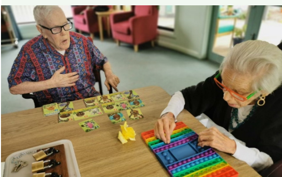
Pictured above: Residents at our Pattinson House aged care community doing meaningful activities that help with memory and/or movement.