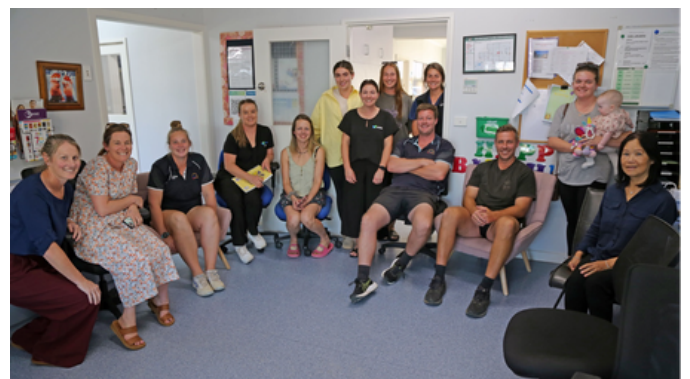
Image L to R: MTHCS Early Years Manager and early years parents gathered for a community engagement session about the possible grant application for EYC facilities expansion at Mallee Minors Ouyen.

A unique feature of the proposed development is its proximity to Pattinson House aged care facility, allowing for the continuation and expansion of intergenerational programs, an initiative already highly valued by both residents and children.