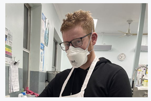
Pictured above: N95 masks are now required on site for all staff, volunteers and visitors.