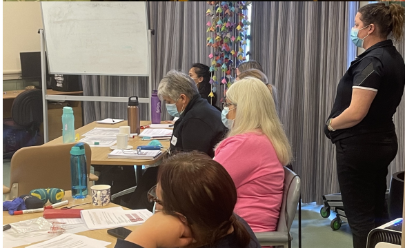
Pictured above: MTHCS Sea Lake staff members taking part in Montessori training.