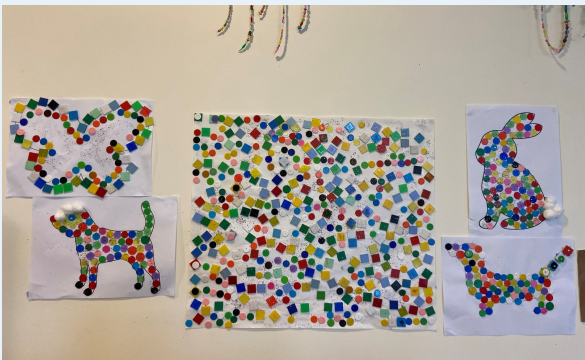
Pictured above: Some of the residents' artworks on display at our Sea Lake aged care community.

There's more information available online at www.coronavirus.vic.gov.au