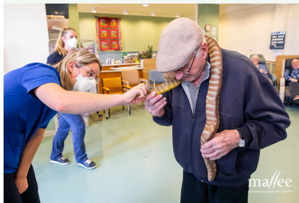
Pictured: One of our fearless residents getting up close and personal with a snake during a recent visit from environmental educator Enviro-Edu.