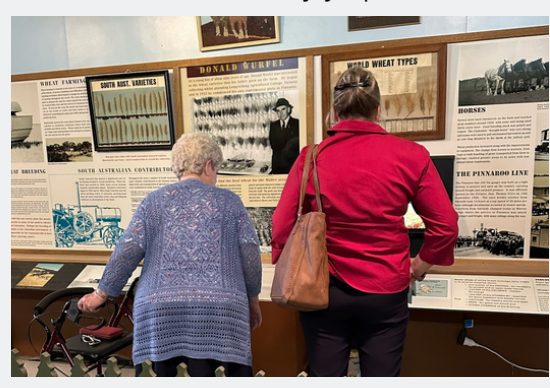
Pictured above: Pinnaroo's heritage museum provided a look into the past.

Our Agile Angels group - one of our social support programs, or planned activity groups is a great way of building friendships and connections in our local community. Their most recent expedition took the angels over the South Australian border to Pinnaroo. The group was able to take a trip back in time with a visit to the museum, wander through the Pinnaroo wetlands and enjoy a pub lunch.