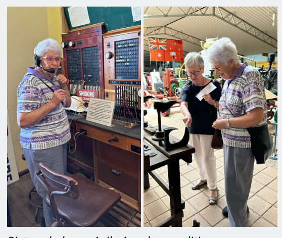
Pictured above: Agile Angels expeditions are always a highlight on the calendar.