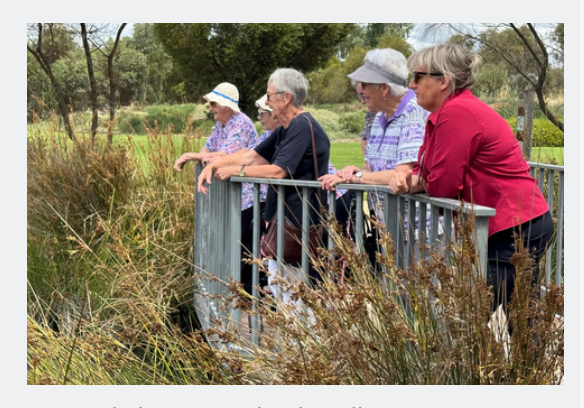
Pictured above: A wetlands walk was a great chance to see the local flora and fauna.