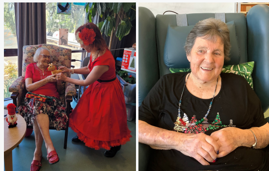
Pictured above: Music and crafts to celebrate Christmas in our Sea Lake hostel.