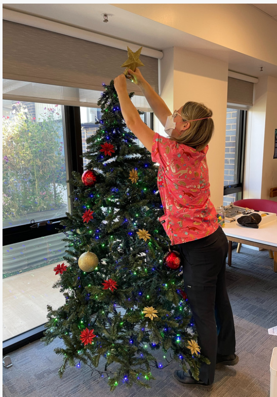
Pictured above: Christmas decorations have been going up at our sites.